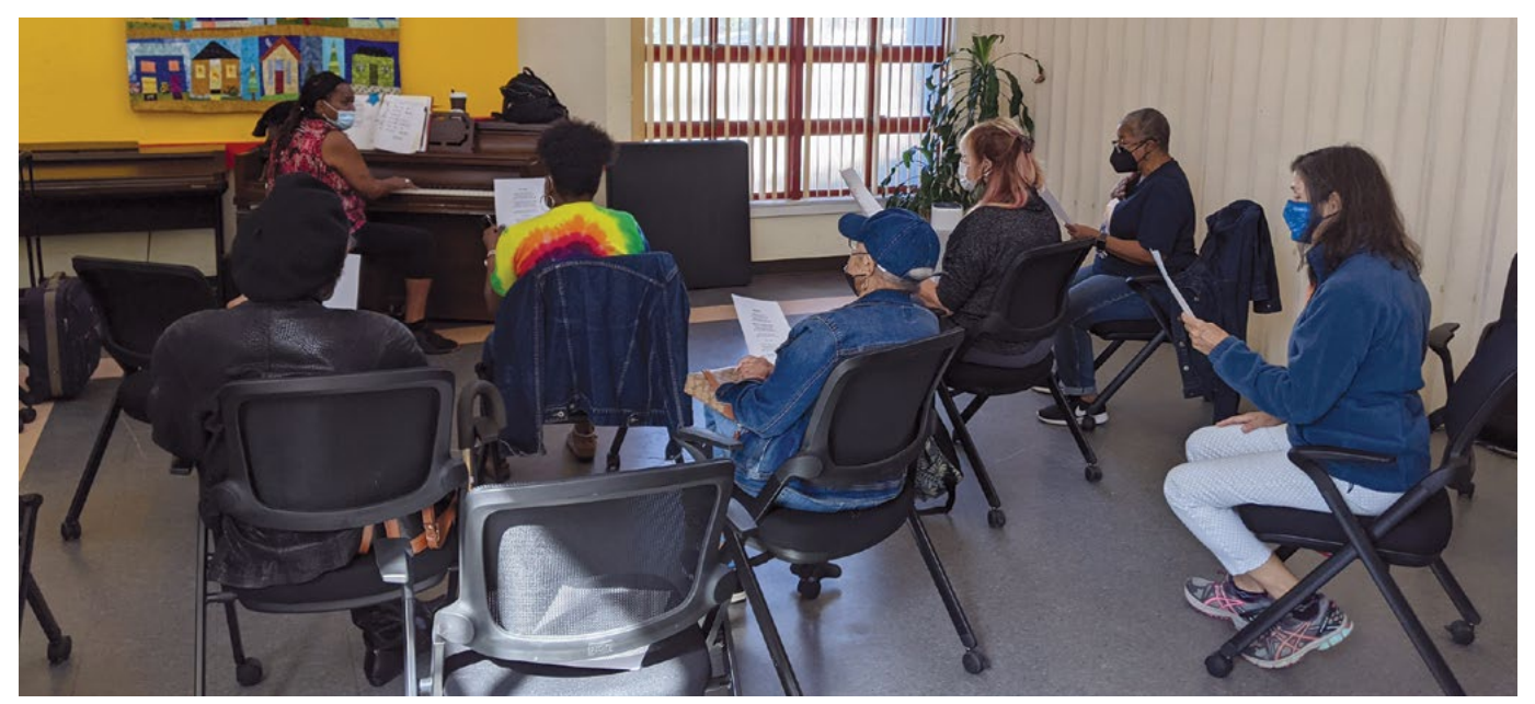
CMC I.T. Bookman Choir: Taught in English. Sings gospel, jazz, and popular songs.