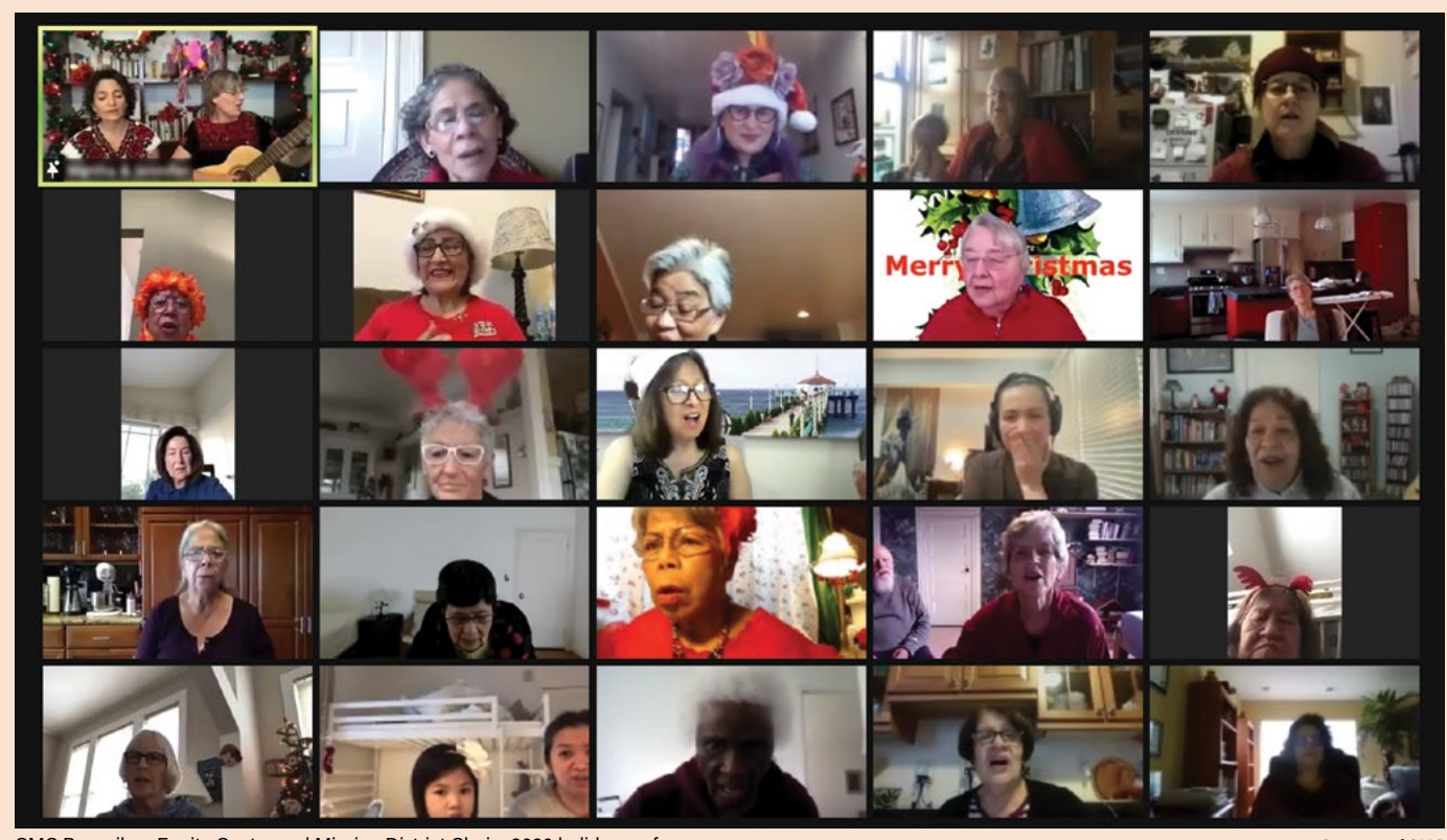
CMC Bayanihan Equity Center and Mission District Choirs 2020 holiday performance.