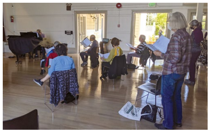
CMC Bernal Heights Choir: Taught in English. Sings show tunes and oldies.