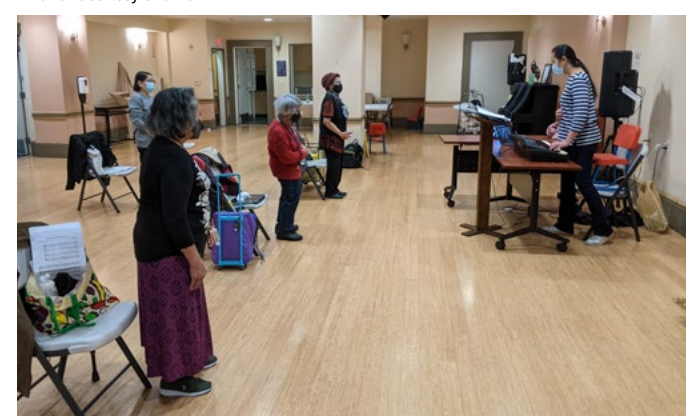
CMC Bayanihan Equity Center Choir: Taught and sung in Tagalog and other languages.

Aging and Adult Services (now the Department of Disability and Aging Services, SF DAS) in a five-year, National Institute of Health-funded study investigating whether singing in a community choir is a cost-effective way to promote health and well-being among culturally diverse older adults. Each choir was